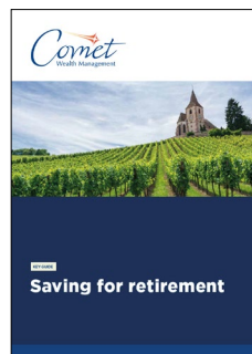
Saving for retirement