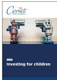
Investing for Children