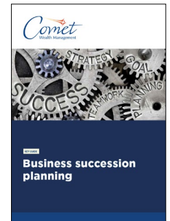
Business succession planning