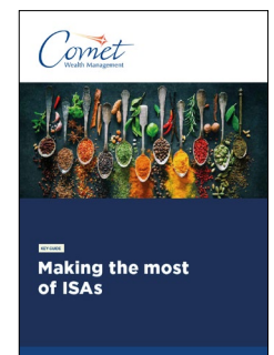
Making the most of ISAs