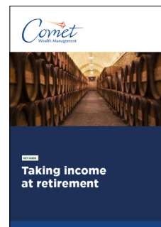
Taking income at retirement