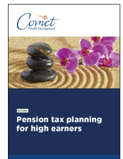
Pensions and tax planning for high earners