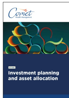
Investment planning and asset allocation