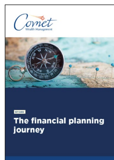
The financial planning journey