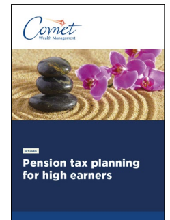
Pensions and tax planning for high earners