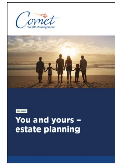
You and yours - estate planning