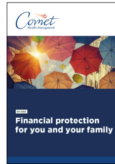
Financial protection for you and your family