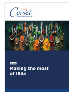
Making the most of ISAs