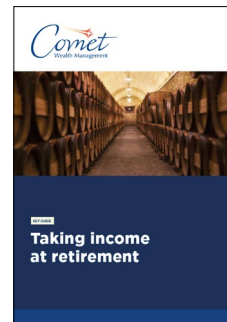
Taking income at retirement