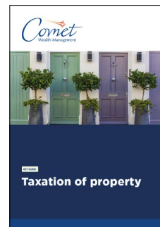
Taxation of property