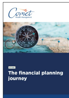
The financial planning journey