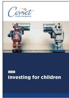
Investing for Children