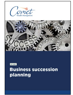
Business succession planning