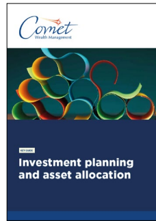
Investment planning and asset allocation