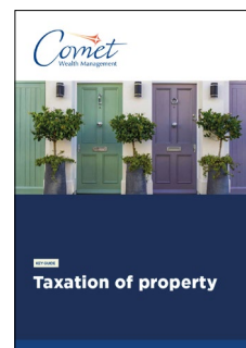
Taxation of property